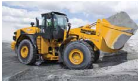
Both the 95Z7XT and the 115Z7XT were tested in various applications.

configuration loader. KCM designed these loaders in conjunction with the Tier 4i loaders introduced in 2013. After testing extensively in the North America market to rave reviews, the loaders are now in mass production. Response from the Field has been overwhelmingly positive.