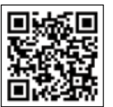
115Z7 and 115Z7XT